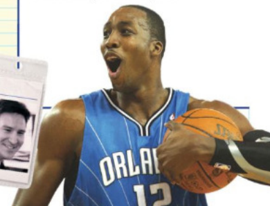
MOURINHO: TERRY: GIAMBI: MCKENZIE: WONKA: HOWARD